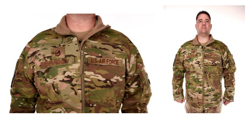
Figure 3.7. Massif Jacket

NOTE: Patches will be worn in the same configuration as authorized for the OCP.