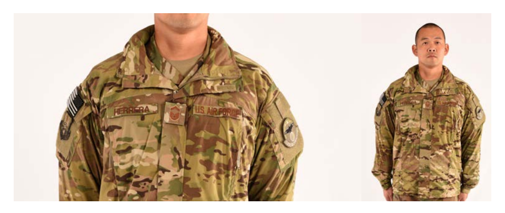
Figure 3.6. Gen III, ECWCS, Soft Shell Cold Weather, Jacket, Level V

NOTE: Patches will be worn in the same configuration as authorized for the OCP.