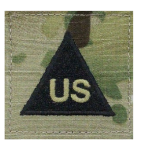
Figure 2.1 DoD Civilian Insignia