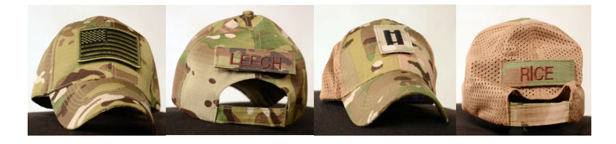
Figure 3.5. Ball Cap, mesh Coyote Brown back