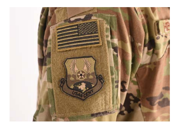
Figure 3.2. OCP Left Sleeve